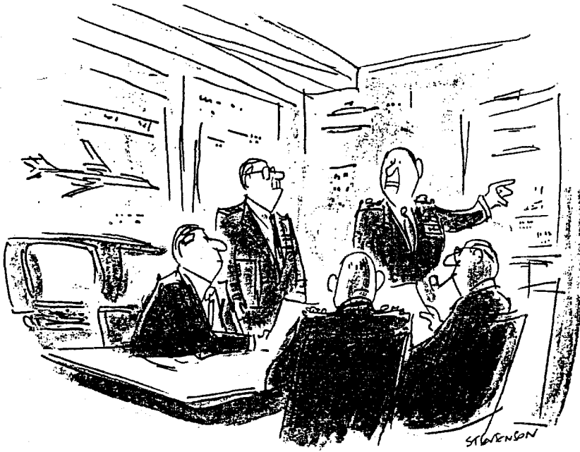
"No, no. When I say this new secret weapon can slip past their defenses undetected, I'm not referring to the Russians, I'm referring to Congress."