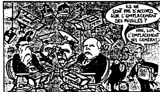
LE MONDE - Mercredi 20 novembre 1985